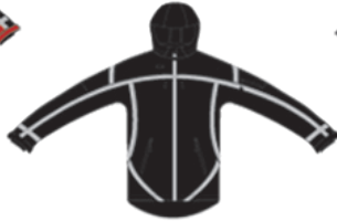
COLORWAY 2 BLACK / BLACK