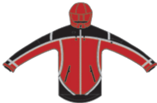
COLORWAY 1 RED / BLACK