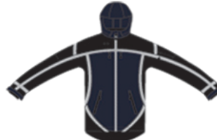
COLORWAY 3 BLUE/ BLACK