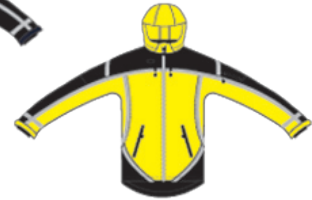
COLORWAY 4 HIGH VIZ YELLOW / BLACK